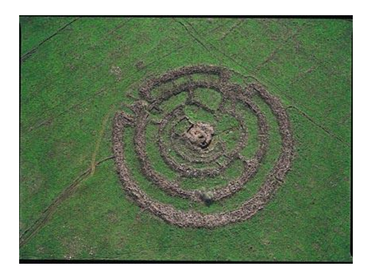
Rugum El Hiri (c.c tiuli)